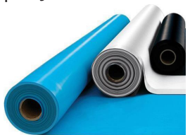
Examples of TPO roof membrane rolls

As demand increases for heat-reflective and energy efficient roofing systems, TPO single-ply roofing membranes continue to provide exceptional resistance to ultraviolet, ozone and chemical exposure.