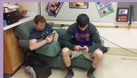
Students using tablets purchased through the grant to learn

Bronson's "Flipping for Math" project was awarded one of 20 mini grants available. The concept behind a Flipped Classroom is students are exposed to the content that will be covered in class prior to the class meeting, where in a traditional classroom setting the first time students hear about course content is during the class. In a Flipped Classroom, students review course content prior to class by watching a lecture video or completing a reading assignment. When the class meets, students practice applying key concepts and interact with peers and their teacher. Then, after class, students are able to check their understanding of the information and focus on areas they find difficult or learn more about areas they are interested in. With the funds, the school purchased an iPad and 3 tablets to flip the calculus classroom.